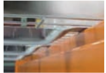
Flared Step Channel

Allows for neat and orderly visual identification of inventory and reduces dust accumulation. Wire Mesh Deck improves fire safety by allowing smoke to rise and water from sprinklers to fall. Acts as a safety net for hand-loaded items as well as for misaligned or broken pallets. A cleaner, more sanitary option while improving illumination of warehouses. Powder coated grey finish with easy clip-on installation. Custom sizes and designs available.